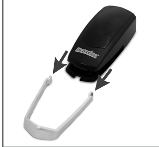
02 • Slide the chrome part.