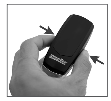
01 • Press the chrome part into the areas indicated on the image.